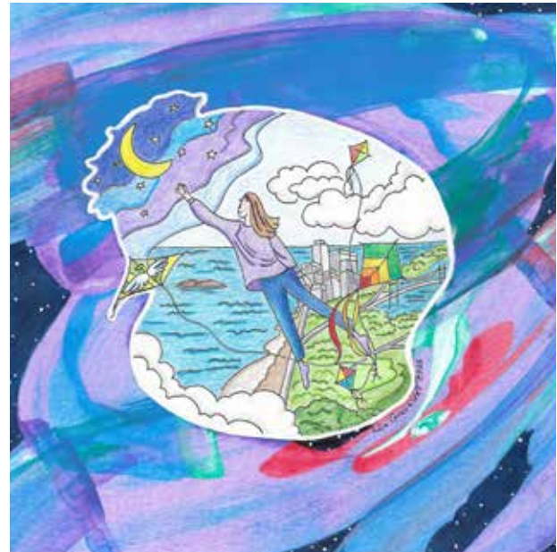
Your original IAM piece of artwork is 8" x 8" and mounted on an 11" x 11" matte board.

When I first connected to your energy I heard this message, "Reach for the Stars", anything is possible. You are a true divine light embodied in human form. You feel like you are always reaching but just quite can't get there. You are "THERE" and you are on your path. Rise above all of the anchors, struggles, obstacles and fears you are feeling. They are NOT TRUE, this is your self negative talk that you are saying to yourself. Give yourself more LOVE and KINDNESS. Practice your meditation each day and at times slowly move out of your body to get a better perspective of where you have been, where you are presently and where you are going. You have accomplished so much and you are blessed. Anything is possible and reach for the stars—universe and beyond. Let your divine light shine and send out more of your healing gifts. You have so much inside of you. Remember to treat yourself with love and kindness first and then you can help others. Take more time to dream and bring your abundance of ideas to fruition.