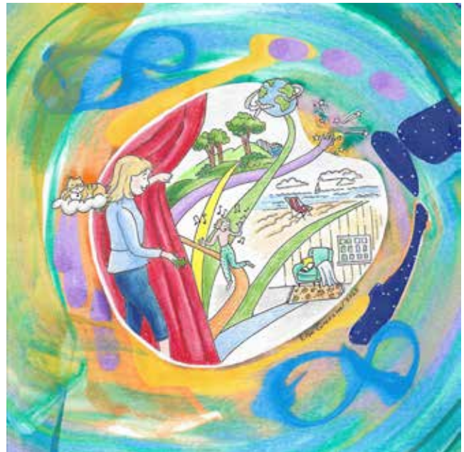
Your original IAM piece of artwork is 8" x 8" and mounted on an 11" x 11" matte board.

Violet (Crown Chakra) – Connect more to the universe and reach for the stars. You are spiritually connected and aware of your truth. Stepping into your own inner wisdom, joy and wholeness you will discover more of the inner peace. Call in Angel Ariel and she will help you clear your limiting human beliefs and will offer to help you awaken to your soul's mission and passions.